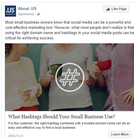
Hashtags and Domain Names