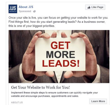
How to Master Lead Generation