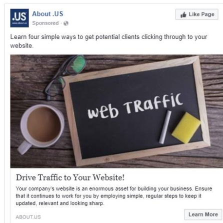
How to Drive Traffic to Your Website