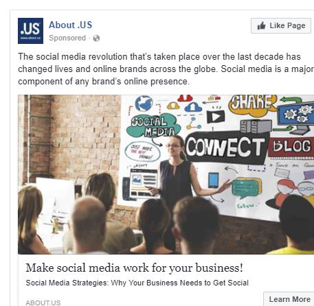
Social Media Strategies: Why Your Business Needs to Get Social