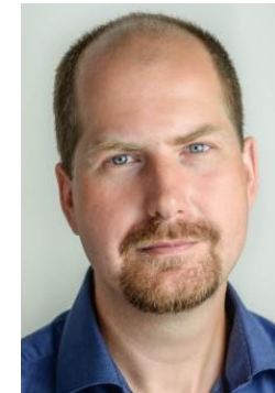
Ondrej .cz (observer)